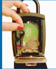
Large Storage Area