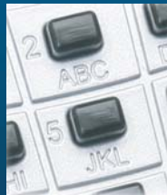
Large Punch Buttons